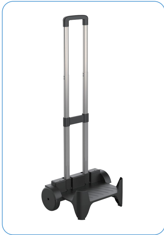
Cart # CT-TOC