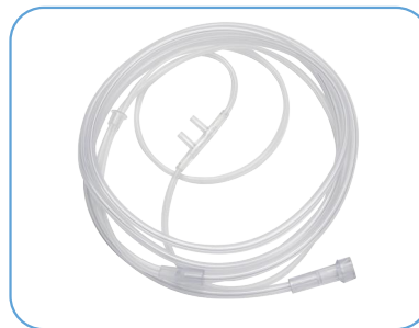
Nasal Cannula: NOC-DAW0721