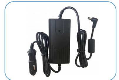
DC Power Supply: ED1010C