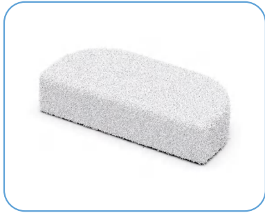
Intake Filter-1: FI-T001