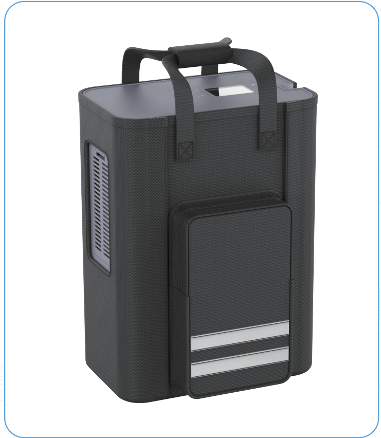
Carry Bag # BP-TOC