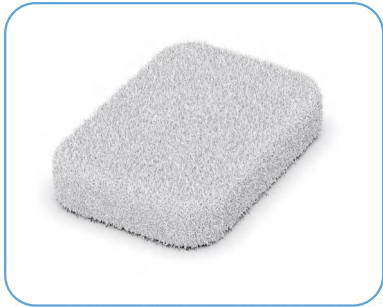
Intake Filter-2: FI-T002